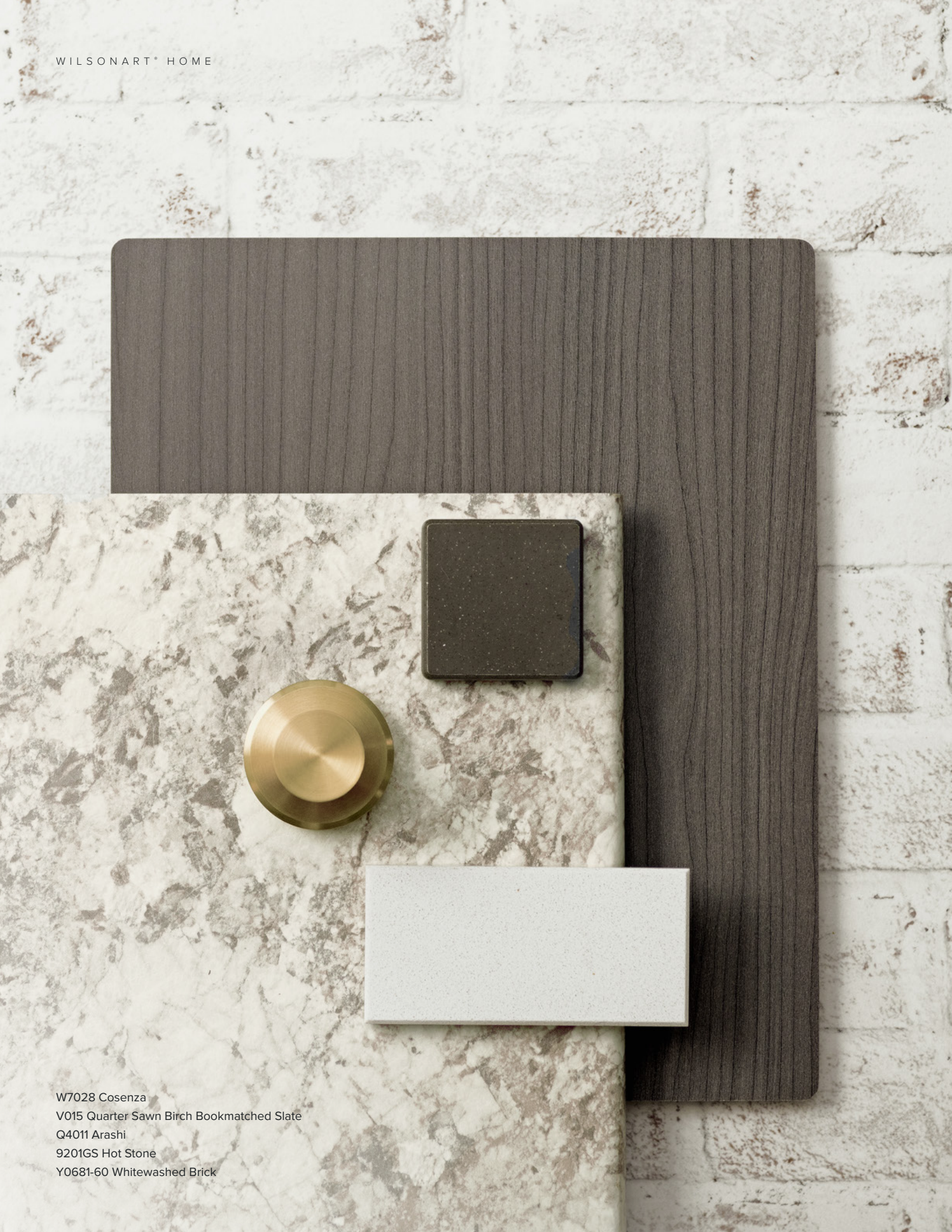
W7028 Cosenza V015 Quarter Sawn Birch Bookmatched Slate Q4011 Arashi 9201GS Hot Stone Y0681-60 Whitewashed Brick