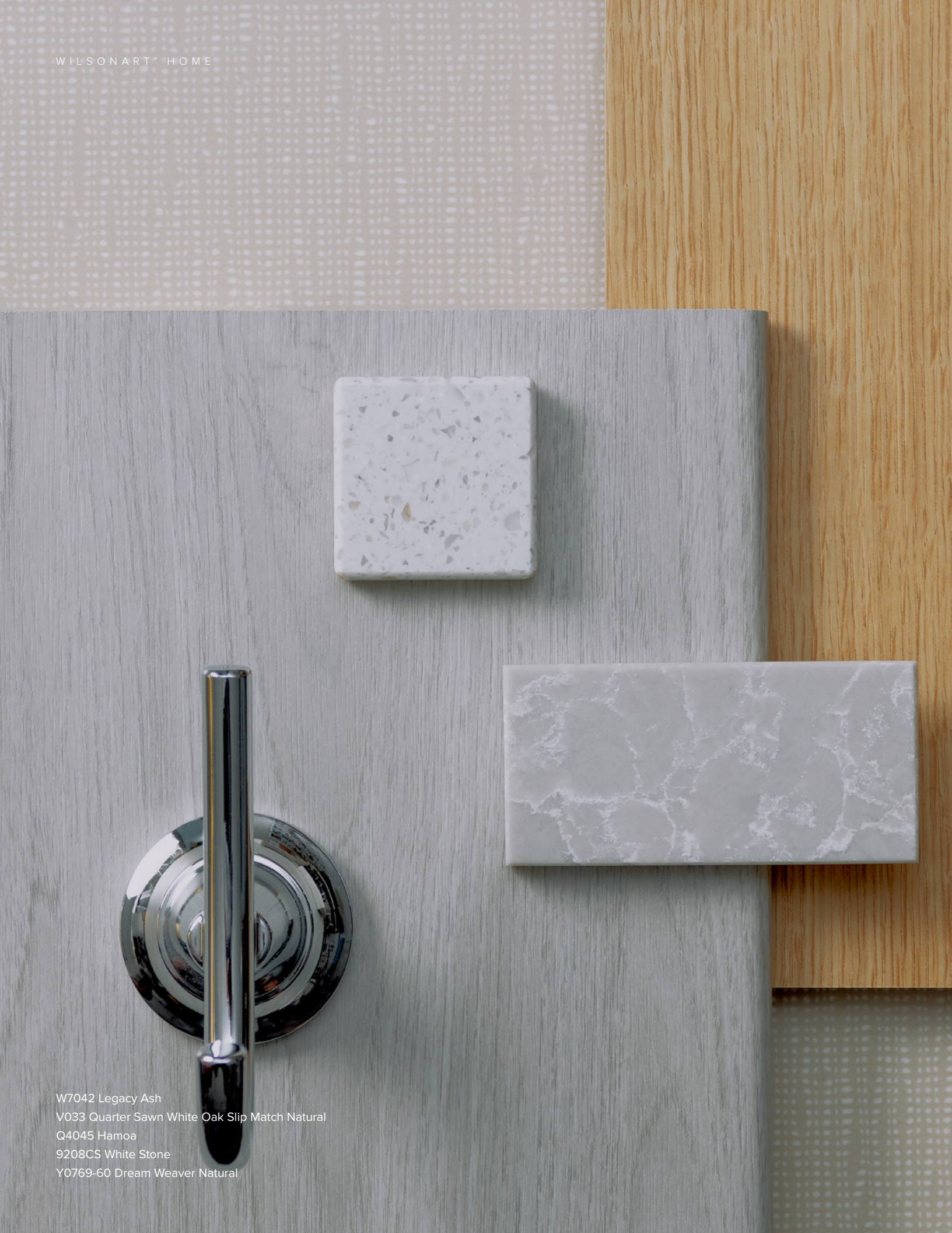
W7042 Legacy Ash V033 Quarter Sawn White Oak Slip Match Natural Q4045 Hamoa 9208CS White Stone Y0769-60 Dream Weaver Natural